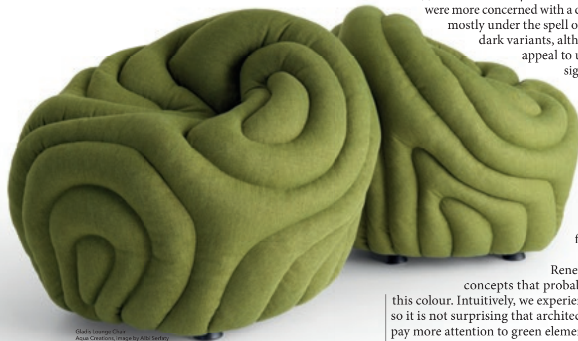
Gladio Lounge Chair Aqua Creations

Renewal, growth, and security are all concepts that probably everyone can associate with this colour. Intuitively, we experience a range of positive emotions, so it is not surprising that architects and designers have started to pay more attention to green elements. And the possibilities are unstoppable. Entire walls and floors, accent surfaces, seating, lighting,