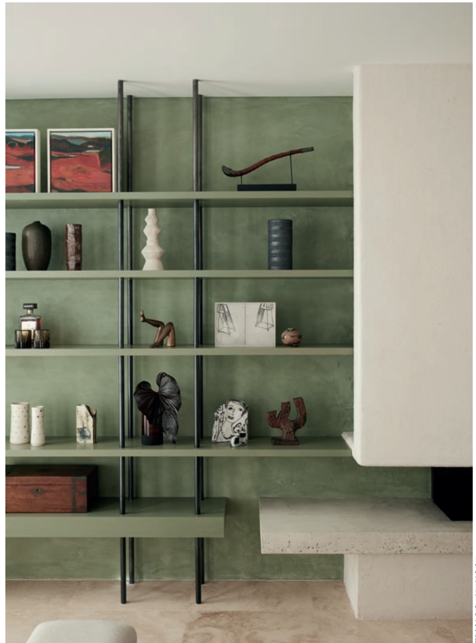
YSG Studio, Budge Over Dower

Those familiar with our network will have heard of designer Bieke Casteleyn before. In her collection of table furniture, she weaves a thread of organic shapes, connecting lines, and colourful playfulness. It should therefore come as no surprise that she too experiments with shades of green. More specifically, we are a big fan of the combination of her dining table model 295 in Olive and coffee table 189 in Alga Marina marble.