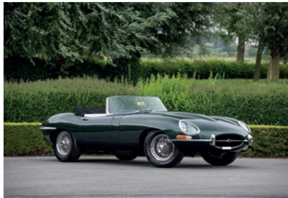
Jaguar E-Type Roadster

Budge Over Dover is a credit to YSG Studio. Although the team operates from Sydney, its members come from different countries and bring together diverse cultural backgrounds. Yet they can filter those many frequencies to a melodic standard, and with this project they prove that they too can work extensively with green. The presence of the colour is part of an elegant 825-square-metre design. For us, the plasterwork in pistachio tone is