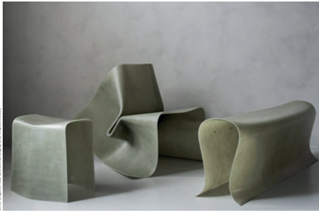
Olivier Grégoire, FOLD Collection

Unique objects for a distinctive atmosphere