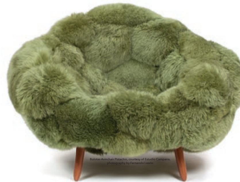
Bolotas Armchair Pistachio, courtesy of Estudio Campana, photography by Fernando Lauso

decorations: every aspect you can think of comes off smoothly with a green look. Daredevils may love interiors that work ton-sur-ton, but wonderful combinations are equally possible. Grey is easily compatible with both light and dark variations, as well as white and brown. An interplay of different shades of green is often a hit as well. In our opinion, the appeal lies mainly in the fact that the colour creates harmony and serenity. The human eye therefore interprets it as one of the most relaxing and peaceful options. For this reason, you will rarely get too many triggers when a room makes extensive use of this beautiful colour. For us, a design item immediately takes on a special look when it does not shy away from standing out a little. The same goes for interiors in general; why curb your love for green? Let the pigment flow, find comfort in the hue of leaves or olives, and enjoy boldness.