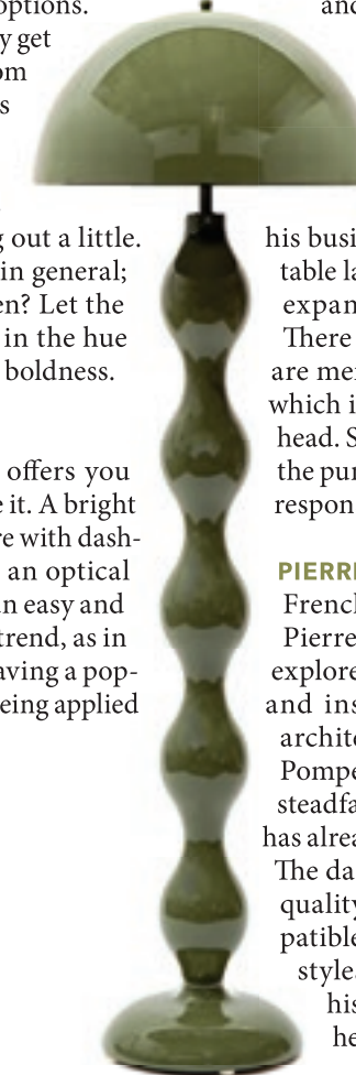
CCSS, Drop Lamp

Entler's creations can safely be called a little weird. Their lighting designs stand out thanks to curved lamps and the sleekness that typifies all the pieces. This green variant fits perfectly in our list, as it is an ideal example of design reinventing itself with a bold shade. Originally starting