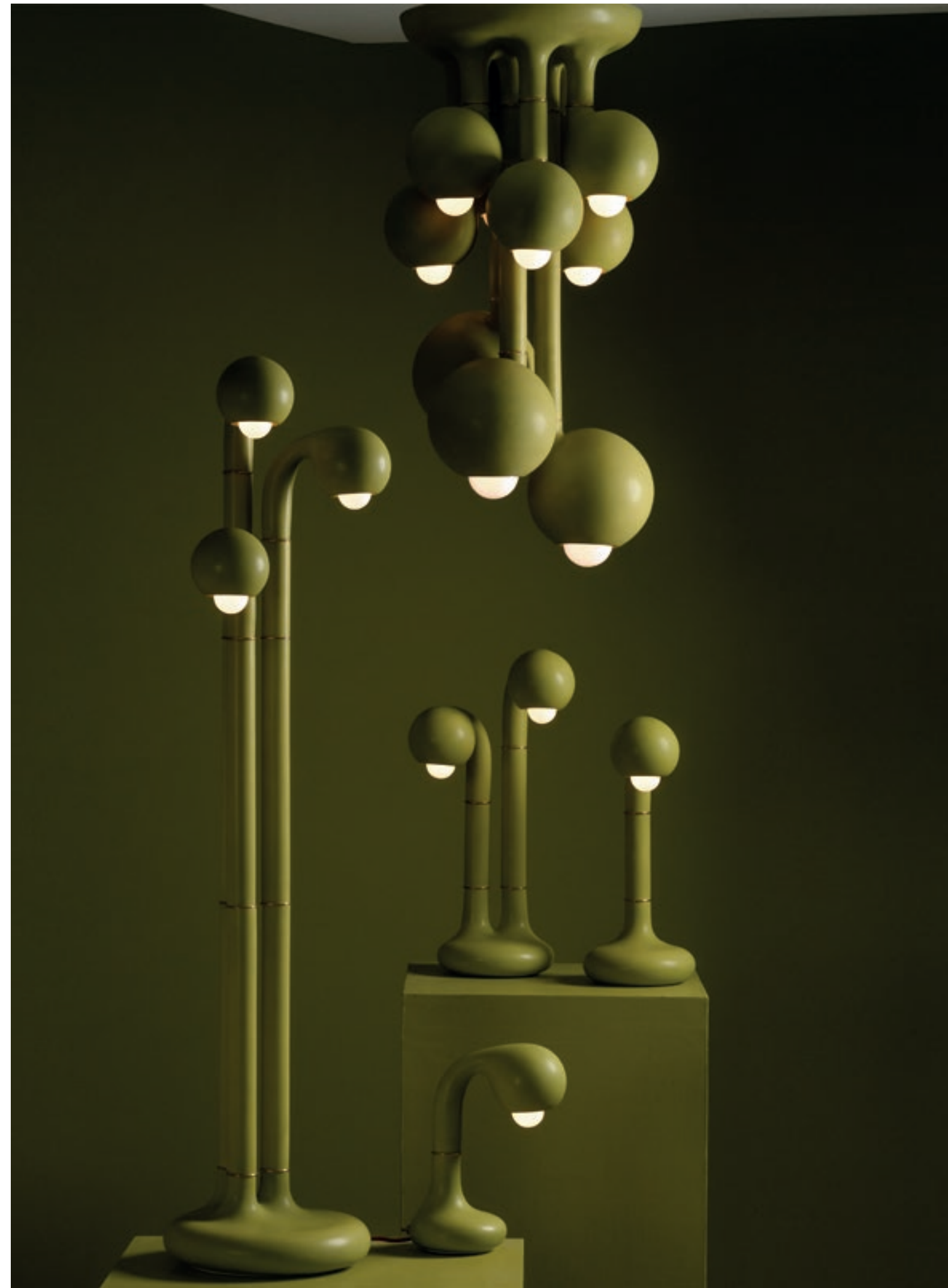
Entire