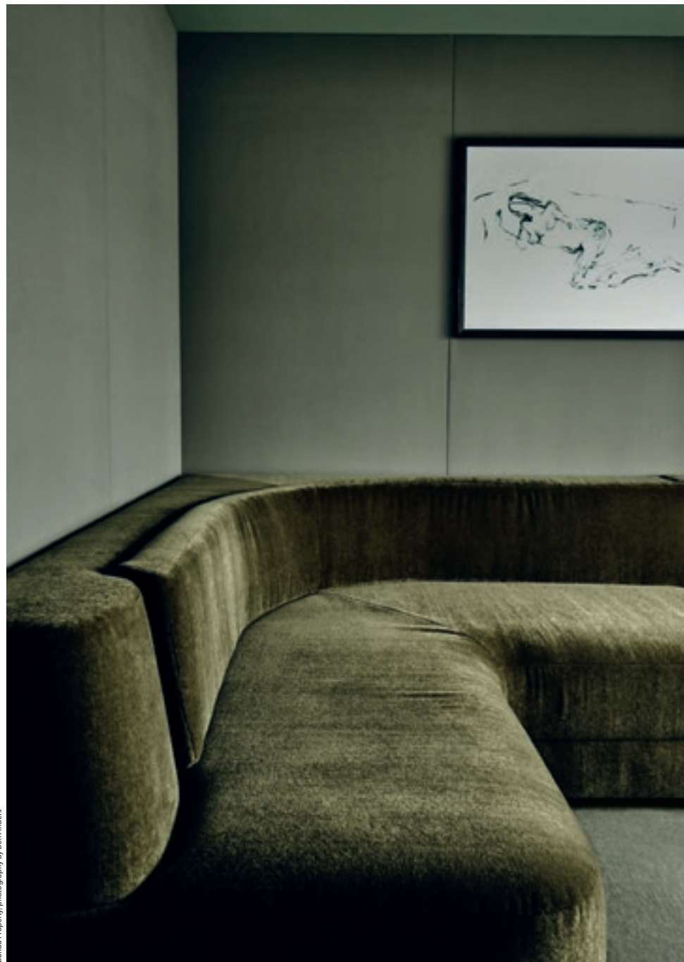
Banda Property