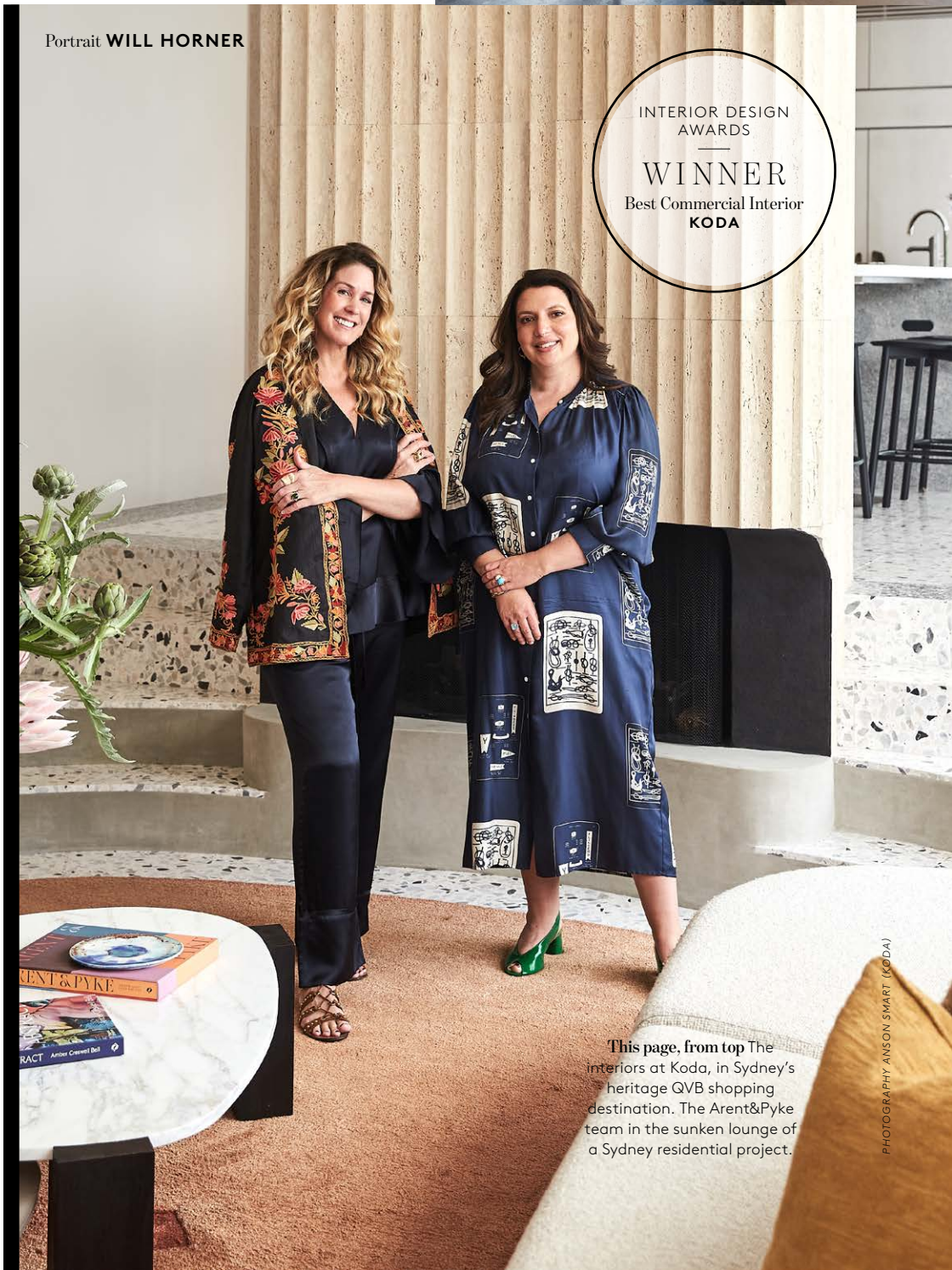
This page, from top The interiors at Koda, in Sydney’s heritage QVB shopping destination. The Arent&Pyke team in the sunken lounge of a Sydney residential project.

INTERIOR DESIGN AWARDS WINNER Best Commercial Interior KODA