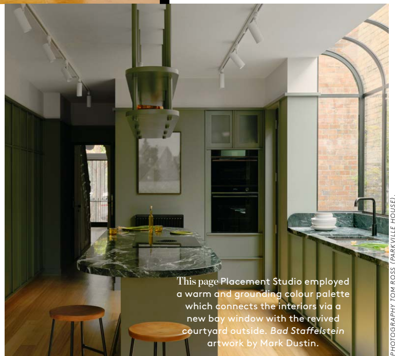
This page Placement Studio employed a warm and grounding colour palette which connects the interiors via a new bay window with the revived courtyard outside. Bad Staffelstein artwork by Mark Dustin.

THE LUSH SCHEME by Placement Studio for this kitchen encompasses walls painted in a deep, muted artichoke green and a darker pine-hued marble with swirling veins lavished upon the curvaceous island benchtop. Looking out onto the kitchen garden via a newly created bay window that pinches a couple of metres from the previously unused courtyard, the space is reminiscent of a Victorian conservatory with its “delicately considered” ribbed glazed insertions with ribbing also seen on joinery. Placement Studio’s mission was to rejuvenate an 1870s Victorian terrace in Melbourne’s Parkville which was “bookended by similar homes projecting a strong heritage street presence”, explains co-founder and director Jacqueline O’Brien who helmed the project. The central social space of the kitchen creates a backdrop for the family to come together to share a meal or entertain – a place for deliberate gathering and connection to the verdant outdoor spaces. “We embraced familiar Victorian heritage elements: soft arches, stone, mosaic tiling, and a rich colour palette that feels warm and grounding,” explains Jacqueline. Says the client, “From the outset the Placement crew brought an open mind, a receptivity to our design whims, and a fantastic creative spirit that helped us to bring this project to life,” placement.net.au