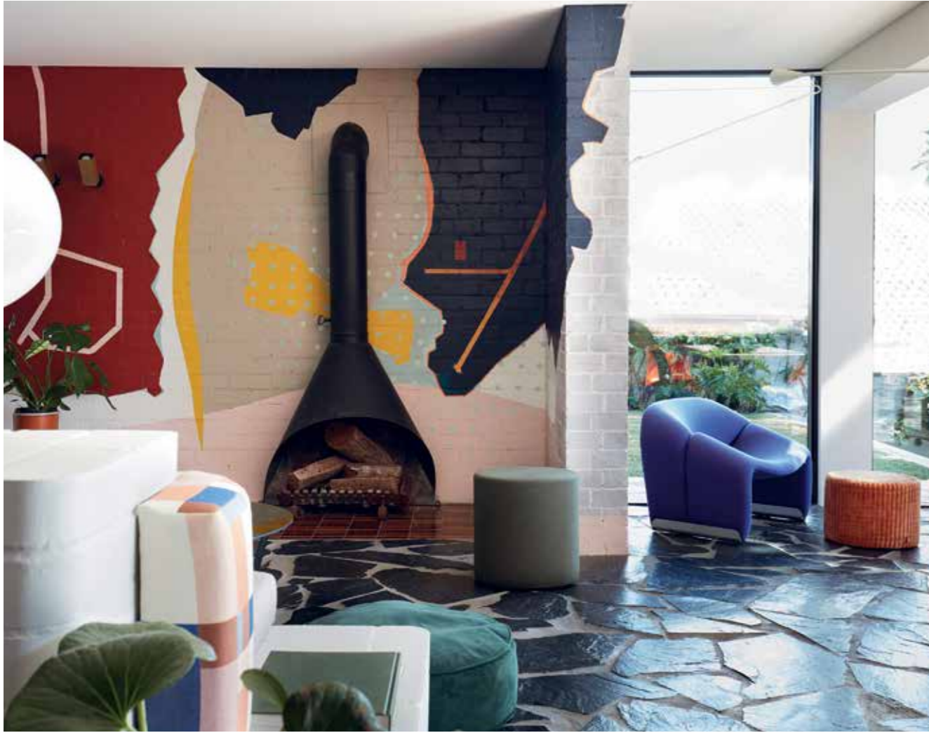
Above: The mural by Lymesmith is inspired by aerial photographs of the property's bayside location.