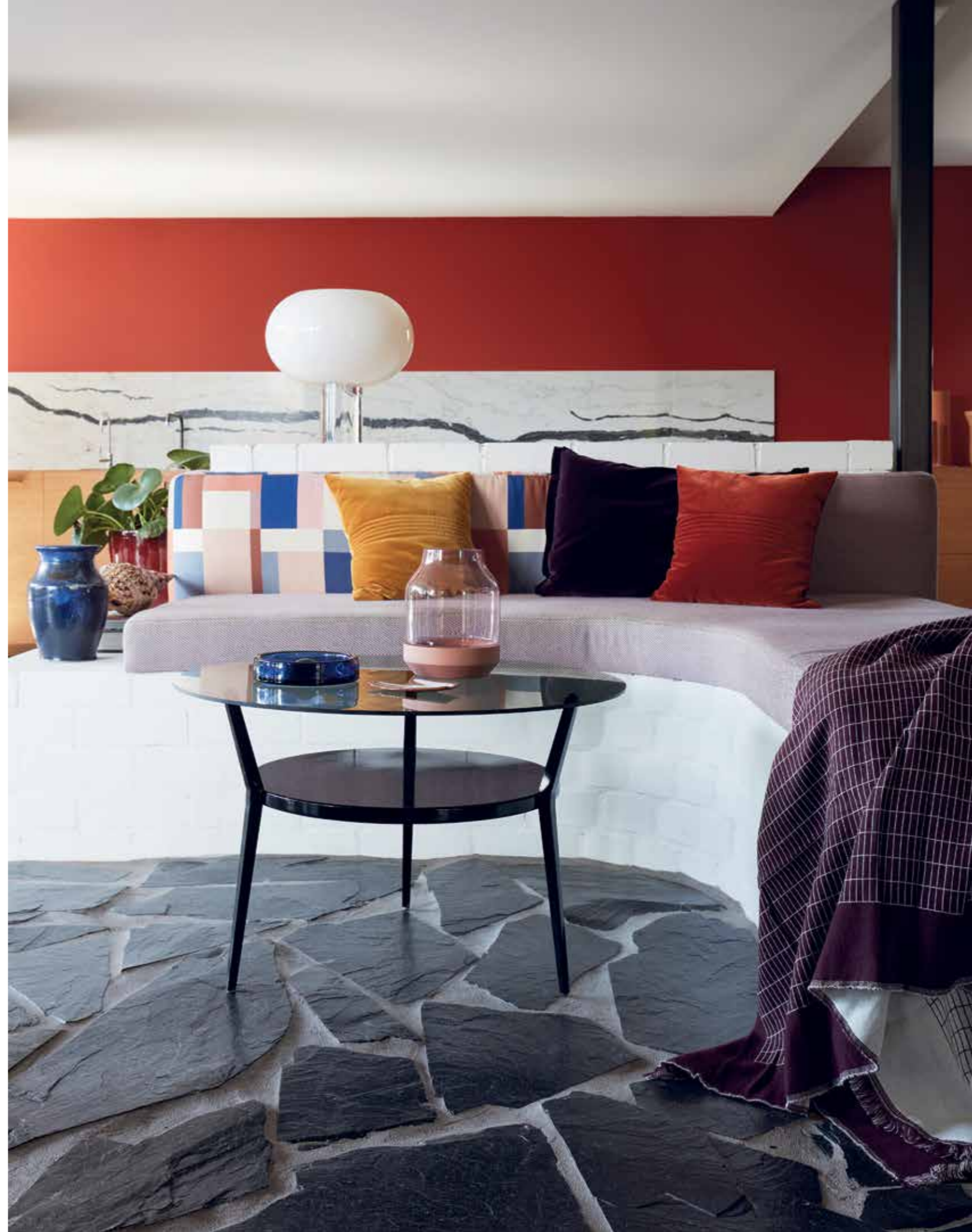
Right: The kitchen and living area are separated by a custom brick plinth with seat pads. Following page: Yellow, red and blue provide bold tonal highlights against the black slate, timber, brick and marble in the kitchen.