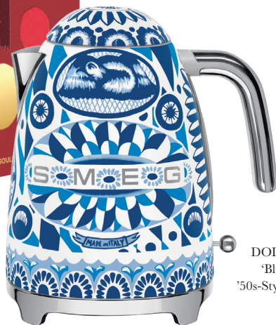
SMEG X DOLCE&GABBANA 'Blu Mediterraneo' '50s-Style Kettle 1.7L, $999.

For a space that radiates energy, creativity and individuality, mix vibrant colours, striking patterns and unexpected textures. More is more when creating a dynamic, uplifting atmosphere that exudes personality – worry less about what goes with what and focus more on the pieces you love. This trend eschews design conventions to embrace joy and self-expression.