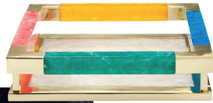
JONATHAN ADLER 'Mustique' Square Tray, $799.