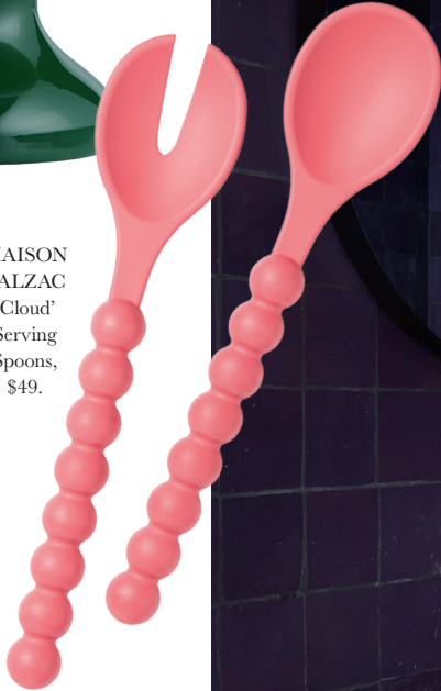
MAISON BALZAC 'Cloud' Serving Spoons, $49.