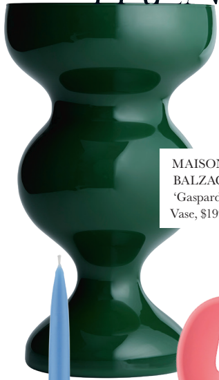
MAISON BALZAC 'Gaspard' Vase, $199.