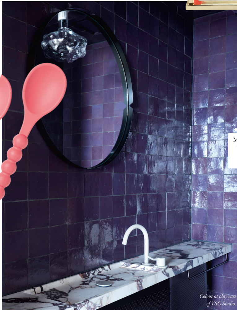
Colour at play care of YSG Studio.

Photography: Prue Ruscoe; Styling: Felicity Ng; Courtesy of YSG Studio. *RRP refers to the supplier's recommended retail price for Australian book retailers.