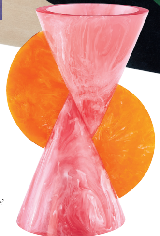
JONATHAN ADLER 'Mustique' Cone Vase, $229.

For a space that radiates energy, creativity and individuality, mix vibrant colours, striking patterns and unexpected textures. More is more when creating a dynamic, uplifting atmosphere that exudes personality – worry less about what goes with what and focus more on the pieces you love. This trend eschews design conventions to embrace joy and self-expression.