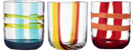
ICHENDORF MILANO 'Gesti' Tumblers, $44.95 each.