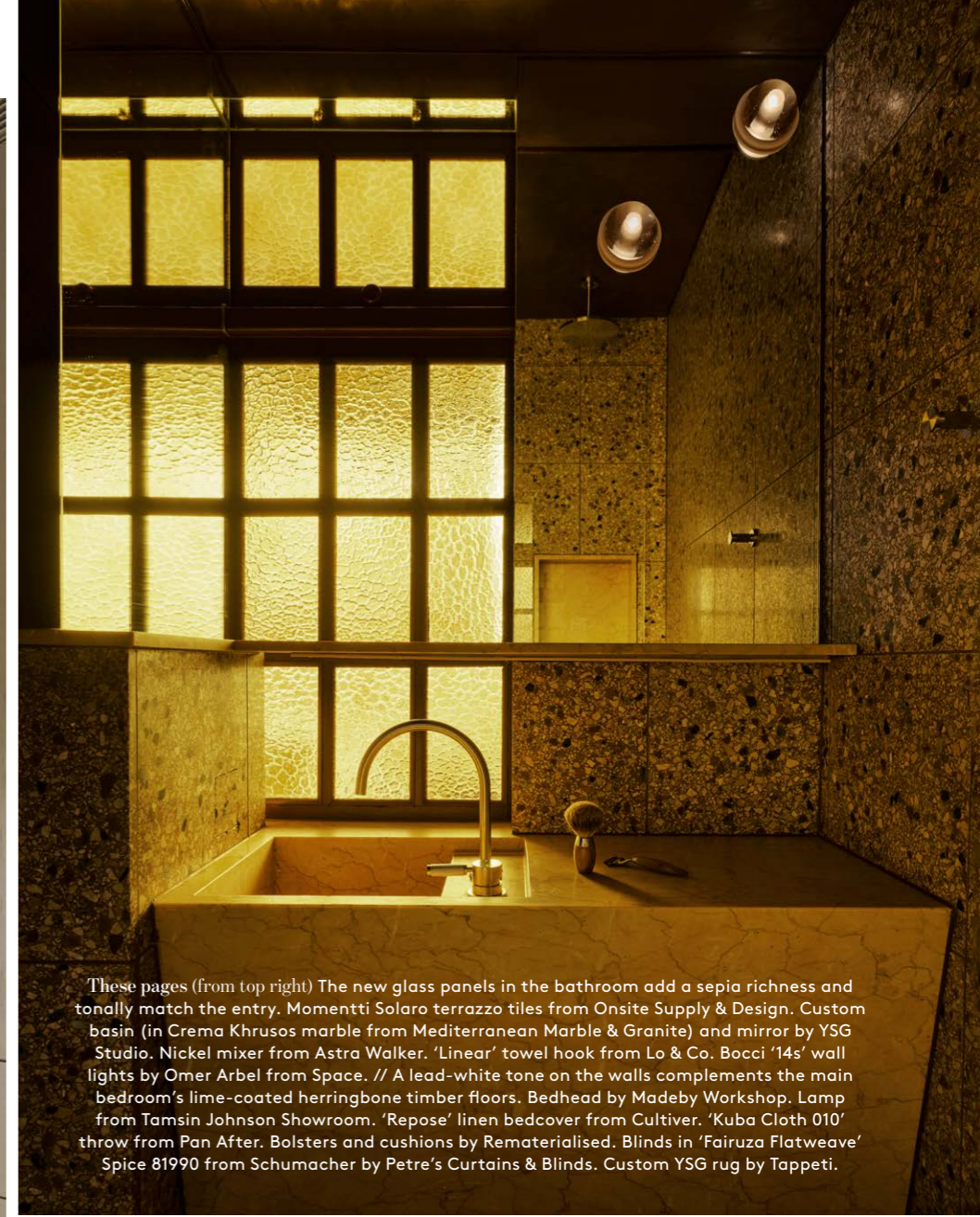
These pages (from top right) The new glass panels in the bathroom add a sepia richness and tonally match the entry. Momentti Solaro terrazzo tiles from Onsite Supply & Design. Custom basin (in Crema Khrusos marble from Mediterranean Marble & Granite) and mirror by YSG Studio. Nickel mixer from Astra Walker. 'Linear' towel hook from Lo & Co. Bocci '14s' wall lights by Omer Arbel from Space. // A lead-white tone on the walls complements the main bedroom's lime-coated herringbone timber floors. Bedhead by Madeby Workshop. Lamp from Tamsin Johnson Showroom. 'Repose' linen bedcover from Cultiver. 'Kuba Cloth 010' throw from Pan After. Bolsters and cushions by Rematerialised. Blinds in 'Fairuza Flatweave' Spice 81990 from Schumacher by Petre's Curtains & Blinds. Custom YSG rug by Tappeti.